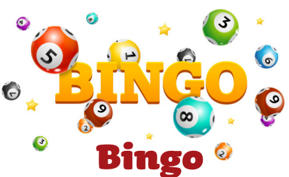
Tuesdays | 7:00 pm | FH/A